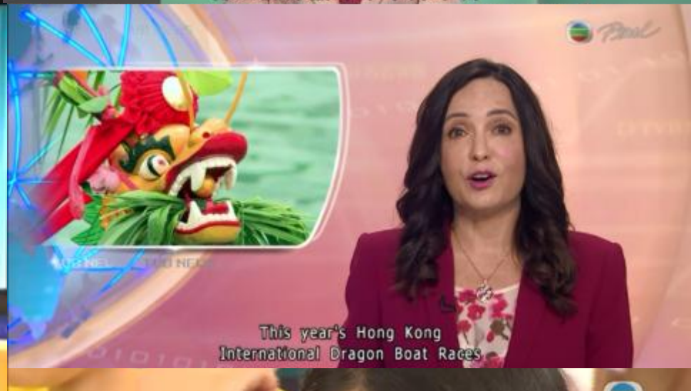
This year's Hong Kong International Dragon Boat Races

now 新聞台 2:2 | now news WhatsApp報料熱線及電郵: 6602-366