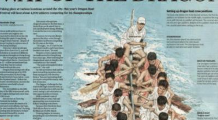
Dragon boating for Hong Kong is like hockey