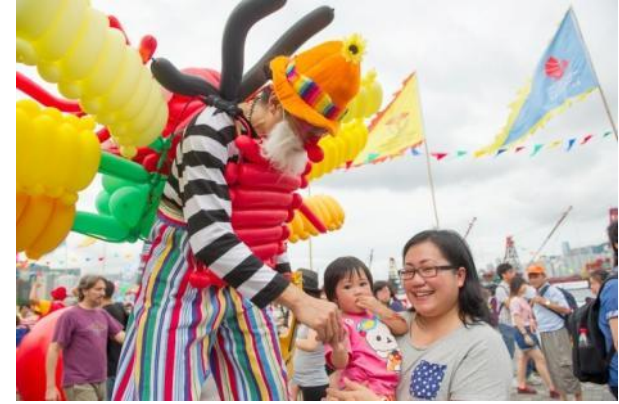
Games & Performances