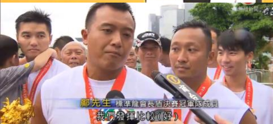
鄺先生 標準龍會長盾決賽冠軍隊成員 我們發揮比較(好)