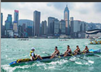
World Rowing Coastal Championships