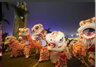
Chinese New Year Celebrations