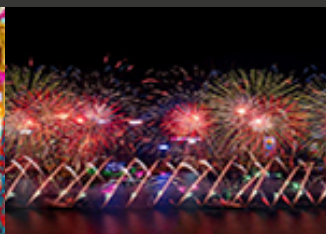
New Year Countdown