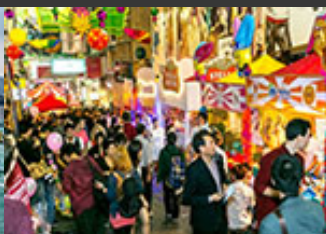
Great November Feast