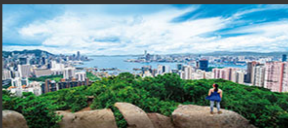
Great Outdoors in Hong Kong